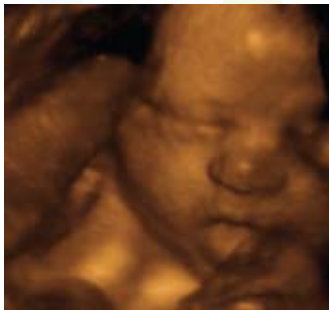
(A picture of what you looked like before you were born)

When a mom has a baby in her womb she is "pregnant." Pregnant means that a mom is "with child" — she has a baby growing in her womb. There are pregnant moms all around the world who have babies growing in their wombs. Many of these babies will be born and grow up to be kids like you.