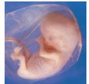
These pictures are of babies before they were born. The image above is an 8-week-old baby. The feet on the left are of a baby only 11-weeks old.